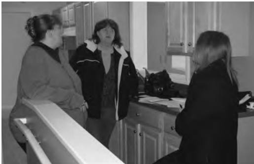
CCBDD and Welcome House staff discussing move in needs for the new licensed home that opened in January 2011.

A custodial services program is now in operation for our properties in Summit County. Two full time NCCCH staff members will be assisting our Summit County tenants with the care of their apartments. History has taught NCCCH the need for this service for many of our Summit County tenants have a difficult time in maintaining their apartments.