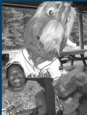
Slider, mascot of the Cleveland Indians, was also on hand to make this a special day for our tenants.