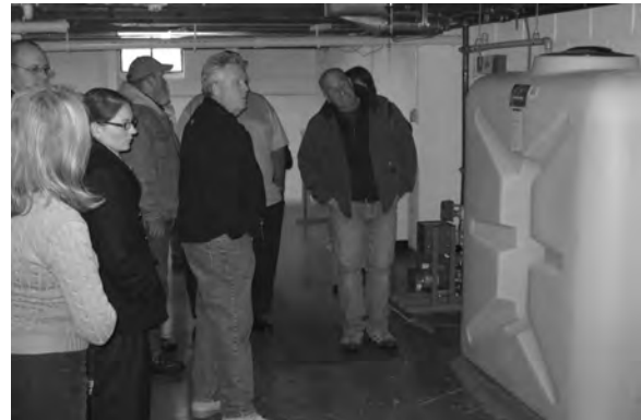
NCCCH completed renovations on a group home for 5 people at the end of 2010. Here Cuyahoga County Board of Developmental Disabilities and Welcome House staff are viewing the sprinkler reservoir tank required for fire protection in licensed homes.

New energy efficient, code compliant windows will be installed in our 20 unit apartment in Akron as funding becomes available.