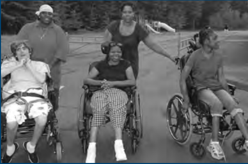
Tenants arriving at the picnic.

The photographs on this page show how much everyone enjoyed the day!