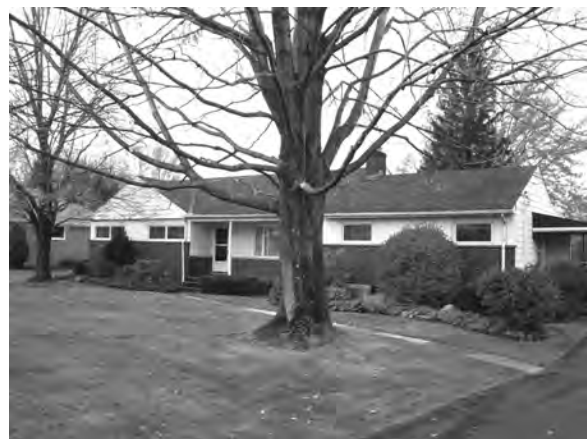
Renovation work on this home in Richmond Heights has begun. When completed this will be the home for 4 tenants.

Thanks to the support of the William J. & Dorothy K. O'Neill Foundation, NCCCH Property Managers are now using a computerized system for entering maintenance work orders, notes on work in progress and completion of work orders. A six-month analysis of this new program has shown that it is working very efficiently. The system allows for instant communication. This faster communication has enabled our maintenance personnel to handle more work orders in a shorter period of time.