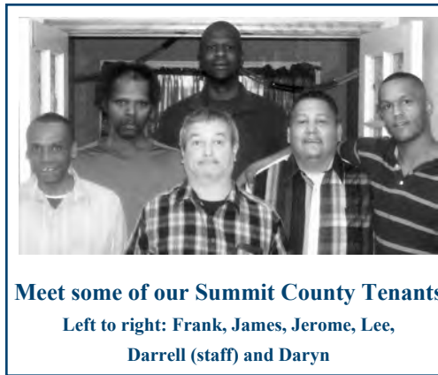
Meet some of our Summit County Tenants

North Coast Community Homes (NCCH) has had the opportunity to provide safe and stable housing to 120 individuals with severe mental illness over the last 13 years. We strive to assist each of our tenants in coping with their individual mental health challenges with dignity and understanding.