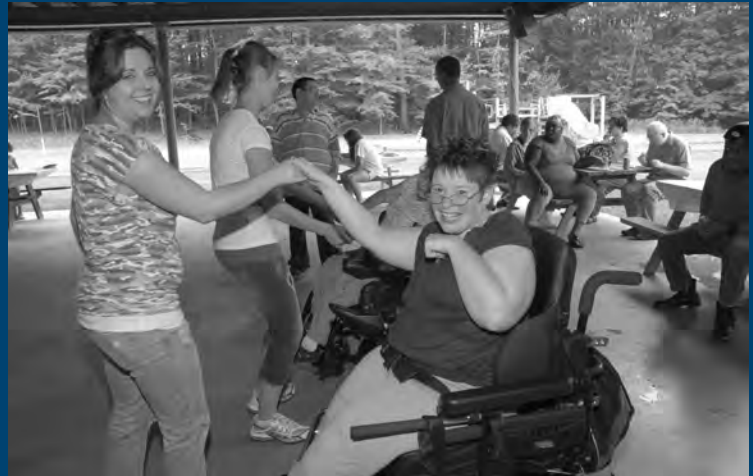
Everyone had the chance to dance -- volunteers and tenants .